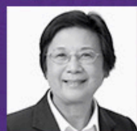
Tracy Yap Tracy Yap Realty